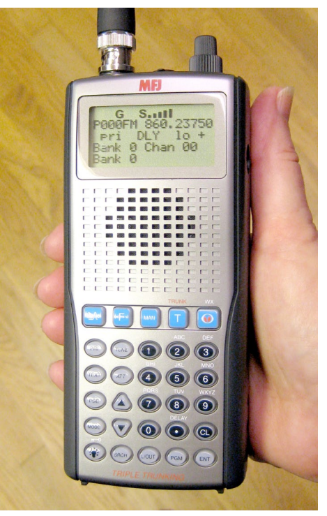
for downloads to and from a PC. An optional computer cable is available as the MFJ-5432 for $29.95.

As enhancements for this model become available, the user may download the upgrades from the GRE website: www.greamerica.com . A 3.5mm (1/8") cloning interface is provided