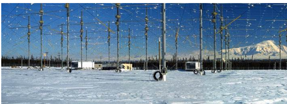
HAARP accused of blasting failed Russian Mars probe.

As if the FCC wasn't swamped by thousands of documents to process, frequencies to police and policy to decide, it also has to maintain a national complaint department. Well, according to an article in the Kansas City Star , the Commission seems to have lost the key to that department. The article reports that the FCC now has a backlog of consumer complaints totaling more than 1 million. And, according to the article, ninety percent of those requests are over two years old with "almost all" of those older complaints having to do with... broadcast indecency.