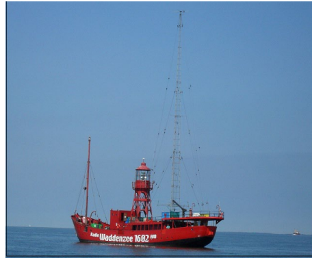
Radio Seagull tests on 1395 kHz.

During a test transmission on 1395 kHz, Euro-broadcaster Radio Seagull went to sea for six weeks this past October and November and netted over 600 reception reports, according to their website www.radioseagull.nl . The greatest distance was a listener in Canada. Radio Seagull normally broadcasts on 1602 kHz from the ship "Jenni Baynton" which is normally moored in Harlingen Harbor in the Netherlands.