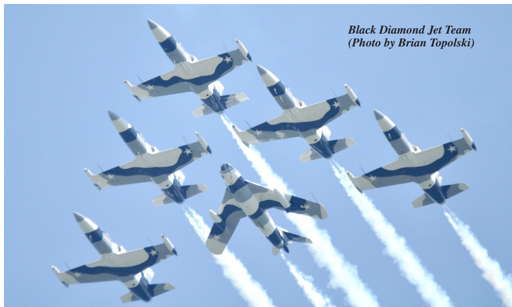
Black Diamond Jet Team

United Kingdom: Red Devils – British Army Parachute Team 462.6250 (Ground Support) 462.925 [Ch 3 Ground Support] 464.250 [Ch