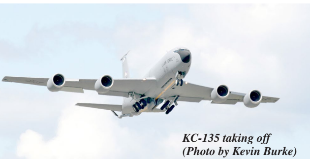
KC-135 taking off

237.800 Solos when not in the show box (Solo #2) and cross country air/air [Channel 8] 251.600 Air/Air nationwide and at NAS Pensacola 255.200 Circle/arrivals discrete and cross country air/air [Channel 17] 265.000 Diamond formation secondary