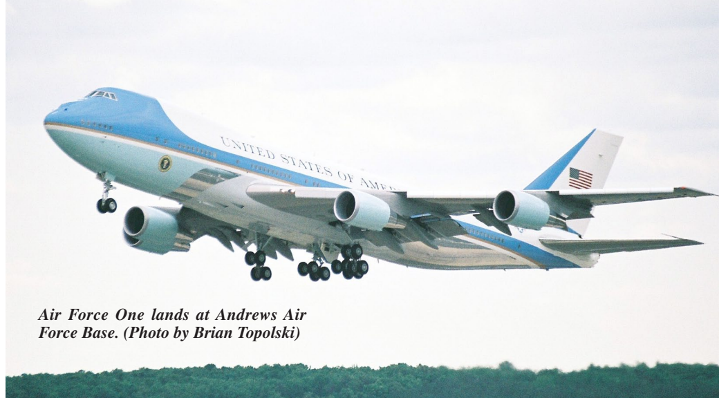
Air Force One lands at Andrews Air Force Base.

The Canadians also have a parachute jump team - the Skyhawks. Frequencies that have been reported for them include 123.000 and 294.700 MHz.