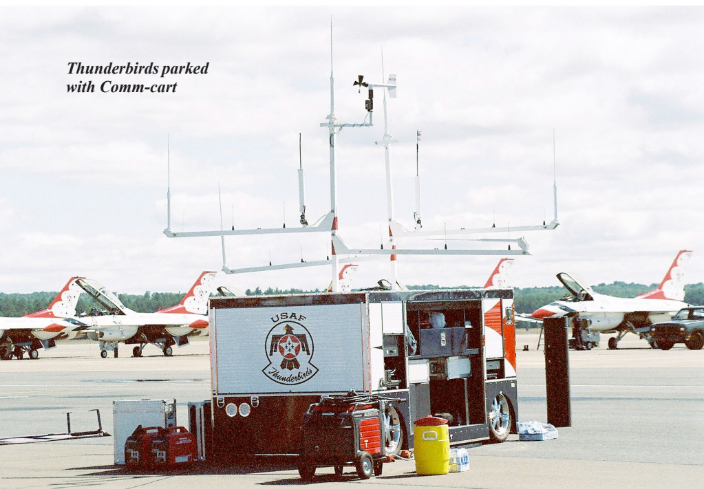
Thunderbirds parked with Comm-cart

The top radio is held by heavy-duty Velcro to the lower radio. The two antenna mounts with BNC connections are securely mounted with magnets, each to a galvanized steel washer which is attached by Velcro to the case. The cart is a collapsible/foldable hand truck purchased at any Lowe's or Home Depot store. Everything is secured to the cart using bungee cords.