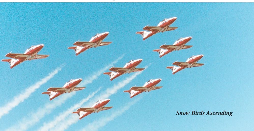
Snow Birds Ascending