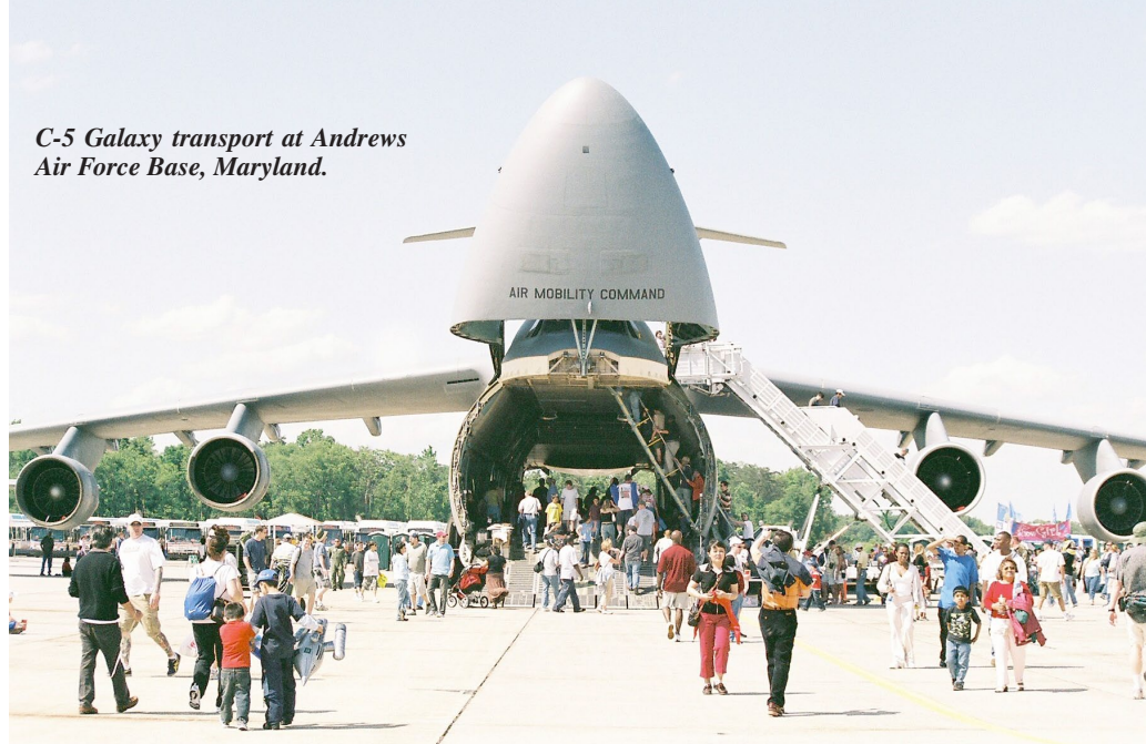
C-5 Galaxy transport at Andrews Air Force Base, Maryland.

certainly bring along a copy of your license. This credential gives you valid reason for having radios on your person.