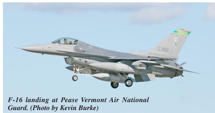
F-16 landing at Pease Vermont Air National Guard.

Previously reported frequencies used by the team are listed below. If you hear any of