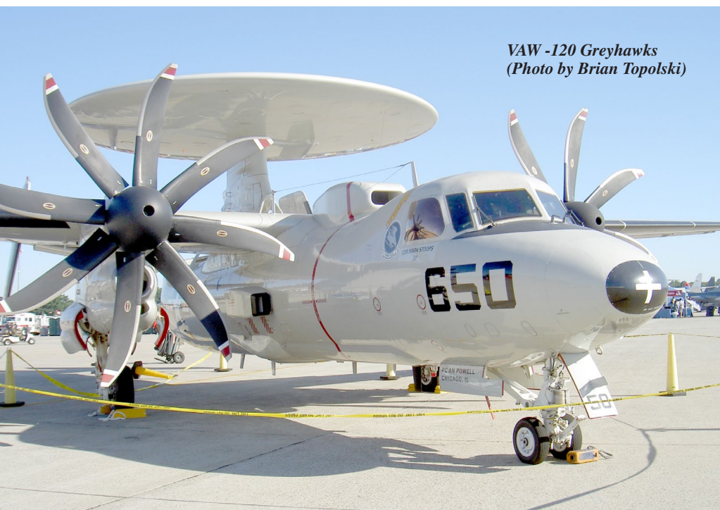
VAW -120 Greyhawks