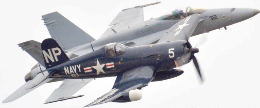
United States Navy Legacy Flight

these frequencies in 2012, please contact us at our email address listed in the Milcom column masthead.