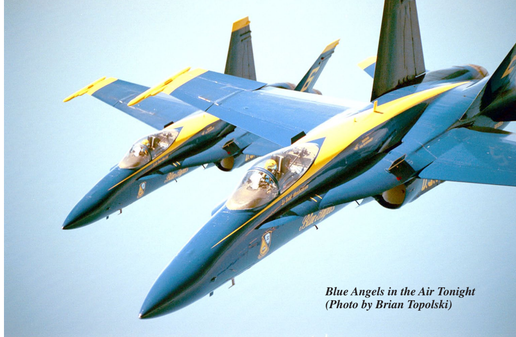
Blue Angels in the Air Tonight

The government version of the Family Radio Service is known as the Inter-Squad Radio or ISR. There have been numerous reports over the last few years of military units, including the Civil Air Patrol (CAP), using ISR frequencies at air shows. I highly recommend programming these frequencies (NBFM mode) into your scanner and also making them a permanent part of your regular monitoring frequency load out.