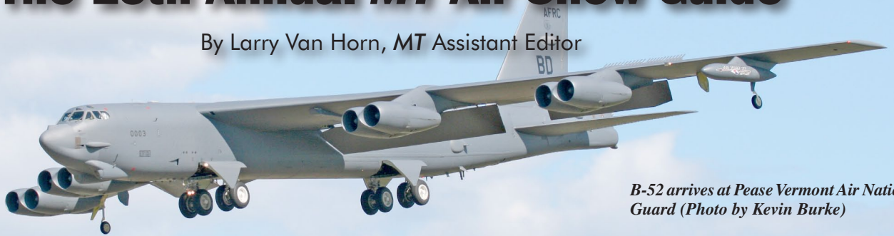
B-52 arrives at Pease Vermont Air National Guard

If the bits of radio chatter in the adjacent box sound familiar to you, chances are you have monitored the exciting communications transmitted by the U.S. Navy Blue Angels at a military air show in the recent past. And nothing will stir up the milcom monitoring enthusiast's juices more than those two magical words – Air Show!